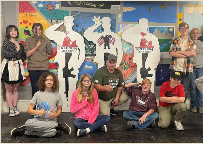
During Community Serve Day, our students had the opportunity to help paint signs for the Battlecross Crusaders to honor our fallen soldiers.