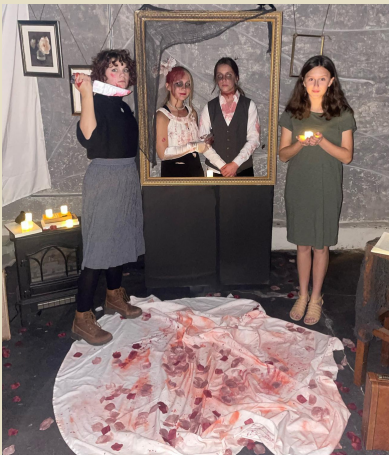
Some of our Student Ambassadors display their scare skills in their originally created "Scares Downstairs." The event was a huge success thanks to our group of student leaders who took their scare jobs very seriously.