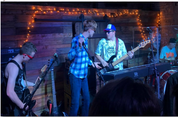
Clinton teen band, From Within