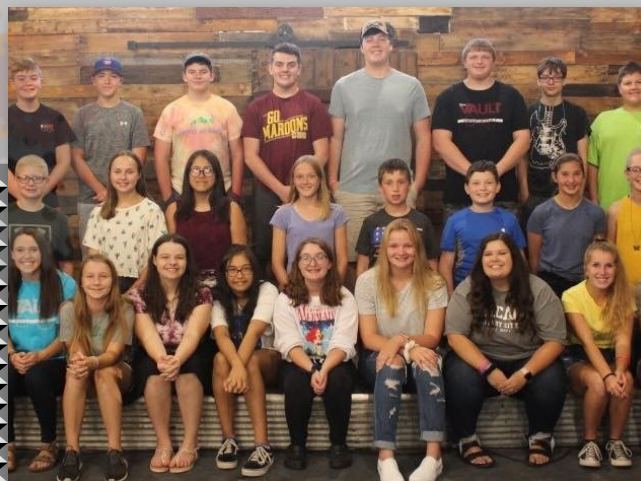
Our 2019-2020 Student Leadership Team

We are combatting these statistics by serving 120-150 students per week and giving them a safe place to hang out with friends; build relationships with adult mentors; participate in programs and classes that teach life, leadership, and employment skills; develop personal responsibility; grow spiritually; and give back to the community through community service projects.