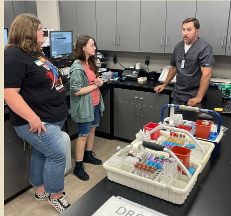
For our Health Care Services Camp, students got a close look at a variety of health care services. The camp highlighted both medically-based careers and mental health careers. Students were able to tour health care facilities and talk with local health care professionals. To top it off, students also received training in CPR!