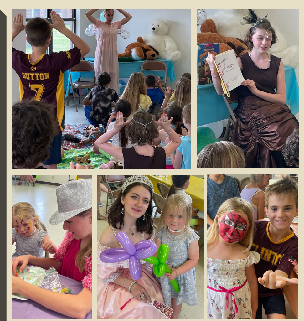
Project Lotus students put on a Summer Fun Day for children at Countryside Apartments.

The community has been very grateful that we are providing opportunities for our teens to experience the joy of giving and the blessing that comes from spreading compassion and surprise cheer! Some parents even raved that it was the most fun their kids had had in a very long time!